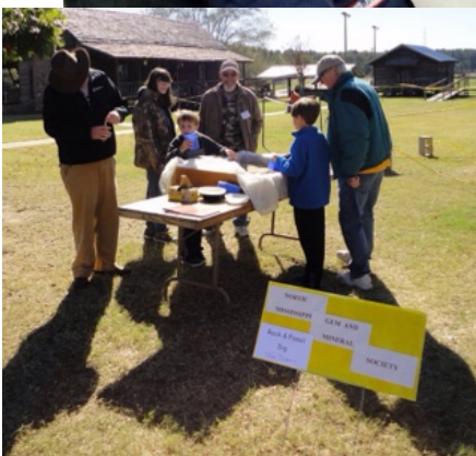
November 1, 2014